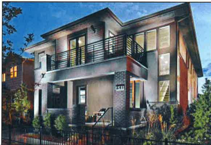
Standard Pacific Homes' new plans at Stapleton, many featuring a porte-cochère

You're going to see other novel ideas, as well: room to seat the entire family around the island, or in a spacious dining area wrapped on two sides by windows. There's also a 'drop zone' with connections either to the garage or the outdoor play area; clever bedroom levels with lots of flexibility; numbers of possibilities for main-floor bedrooms; and an emphasis on bright, well-rendered finished-basement space. "More of our buyers